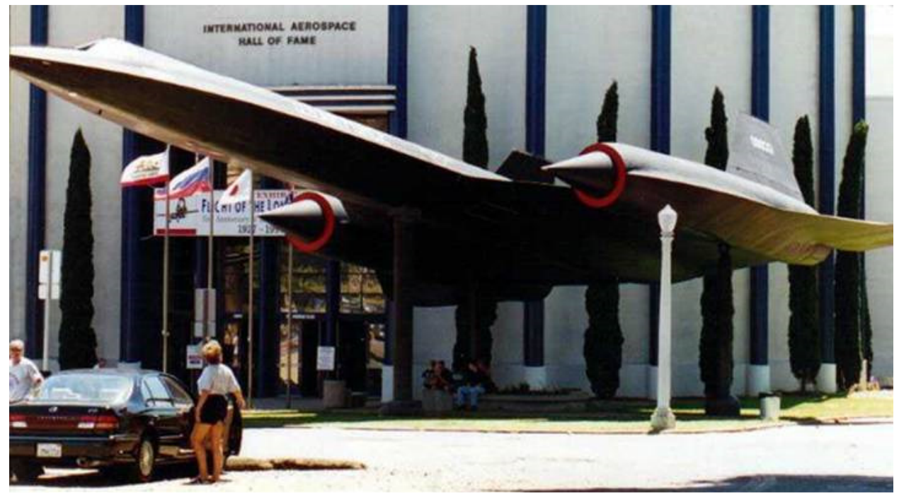
San Diego Aerospace Museum

I knew I had to get my eyes back on the instruments, and reluctantly I brought my attention back inside. To my surprise, with the cockpit lighting still off, I could see every gauge, lit by starlight. In the plane's mirrors, I could see the eerie shine of my gold spacesuit incandescently illuminated in a celestial glow. I stole one last glance out the window. Despite our speed, we seemed still before the heavens, humbled in the radiance of a much greater power. For those few moments, I felt a part of something far more significant than anything we were doing in the plane. The sharp sound of Walt's voice on the radio brought me back to the tasks at hand as I prepared for our descent.